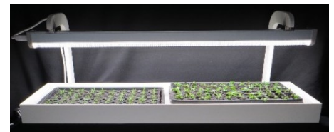
10”x20” Grow Trays Configuration